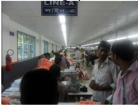
Checking in process